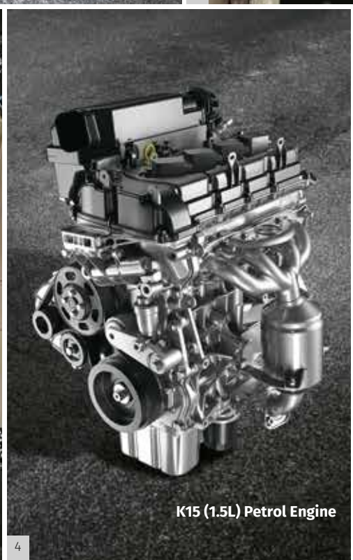
K15 (1.5L) Petrol Engine